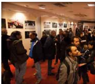
Trieste, Italy, 2014