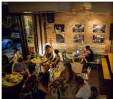
Belgrade, Serbia, 2017