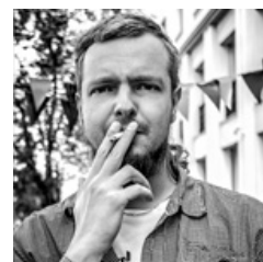
ADRIAN MIRGOS Polish photographer