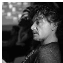
DIEGO ORLANDO Photographer