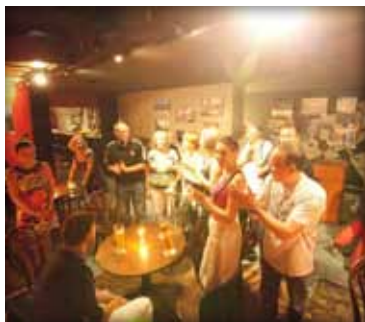
Krakow, Poland, 2011