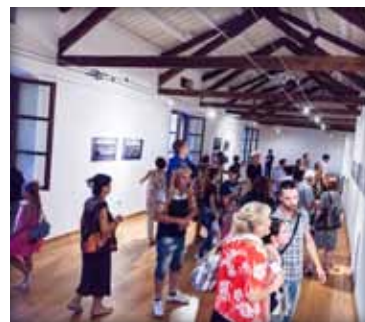
Poreč Museum, Croatia, 2017