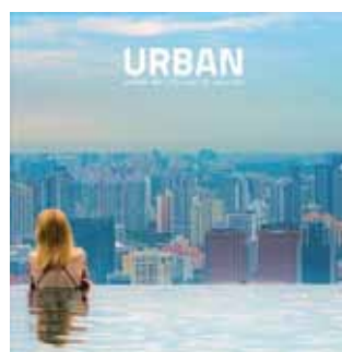
Vol. 03 144 photographers from URBAN 2017 22×22 cm paperback 198 color pages