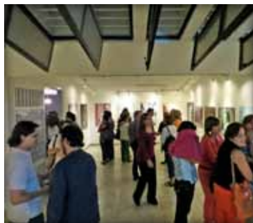
Bucaramanga, Colombia, 2012