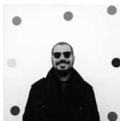
FELIPE ABREU Brazilian photographer