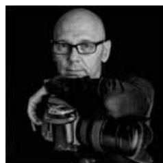
PEPE CASTRO Spanish photographer