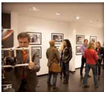
Riga, Latvia, 2013