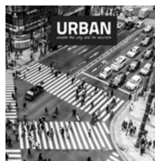
Vol. 04 127 photographers from URBAN 2018 22×22 cm paperback 218 color pages