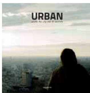
Vol. 01 81 photographers from URBAN 2015 22×22 cm paperback 192 color pages