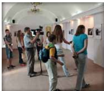
Sumy, Ukraine, 2014