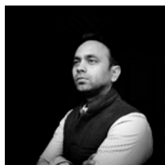
ROHIT VOHRA Indian street photographer