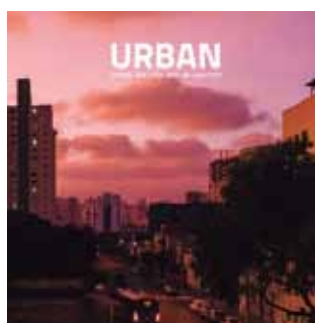
Vol. 02 83 photographers from URBAN 2016 22×22 cm paperback 184 color pages