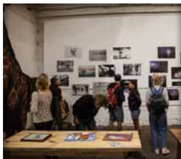
Berlin, Germany, 2016