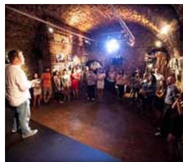
Krakow, Poland, 2014