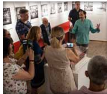
Rijeka, Croatia, 2018

URBAN is promoted by dotART - Art association