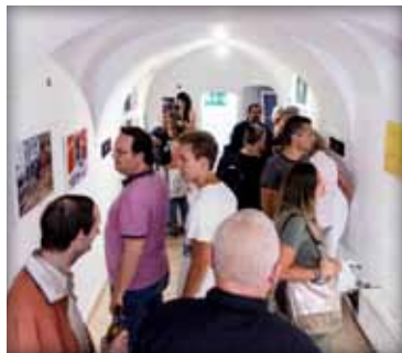
Klagenfurt, Austria, 2018