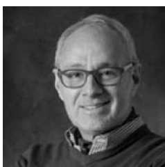
SILVIO MENCARELLI Italian photographer