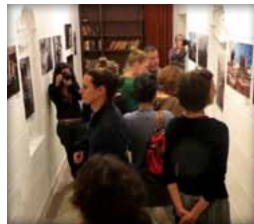
Budapest, Hungary, 2012